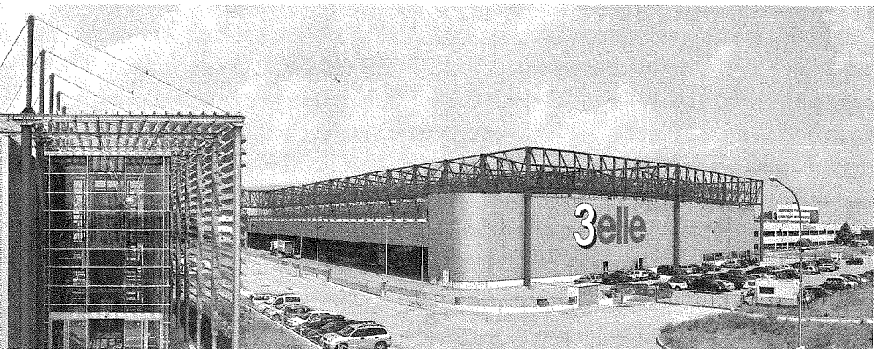
Coop. 3 Elle