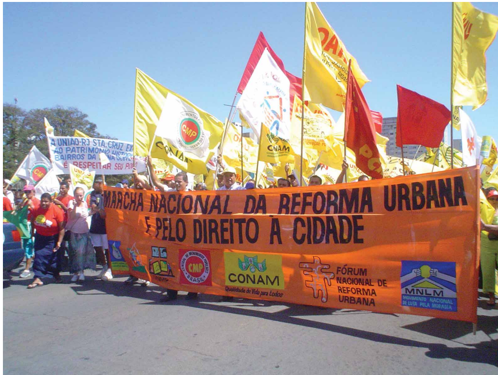
Figure 1 Banner and demonstrators from CMP ( Central dos Movimentos Populares ) and Brazilian urban movements at the National March for Urban Reform and for the Right to the City, Brasilia, September 2005