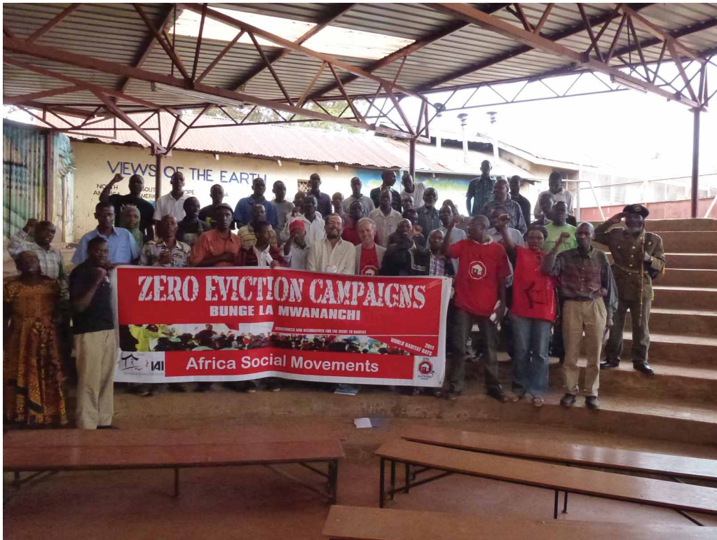
Figure 3 Launch of zero eviction campaign in September 2011, Korogocho, Nairobi

of IAI, echoes others' positions as well, and is probably a central line of divide that results from interviews and direct observations. According to the movements, who should voice and decide on people's positions should be the people themselves, and not professionals or technicians from NGOs.