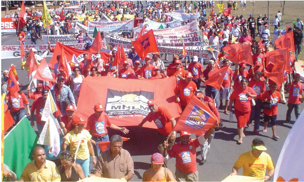
Figure 2 Delegation from MNLM, Brazilian Movement for Housing Struggle, at the National March for Urban Reform and for the Right to the City, Brasilia, September 2005

also a struggle for lots, housing, sanitation and other needs of the population. The movement is organized in 15 states (MNLM website, accessed 3 January 2012).